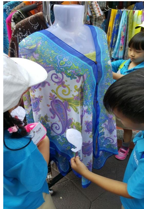
Children finding the mango motif at Little India