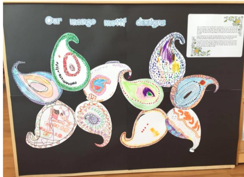
Examples of children's mango motif designs

Write a class story about the children's experience in Little India (use photographs to help them to recall what they did and saw there). Children can also create an artwork that reflects their learning in Little India such as designing their own mango motif.